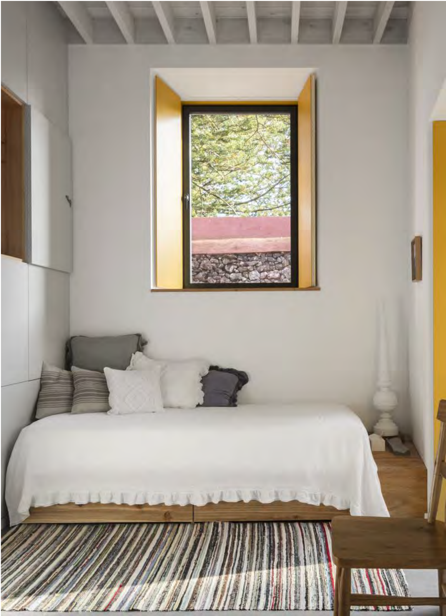
Traditional carpets at the Pink House in the Azores