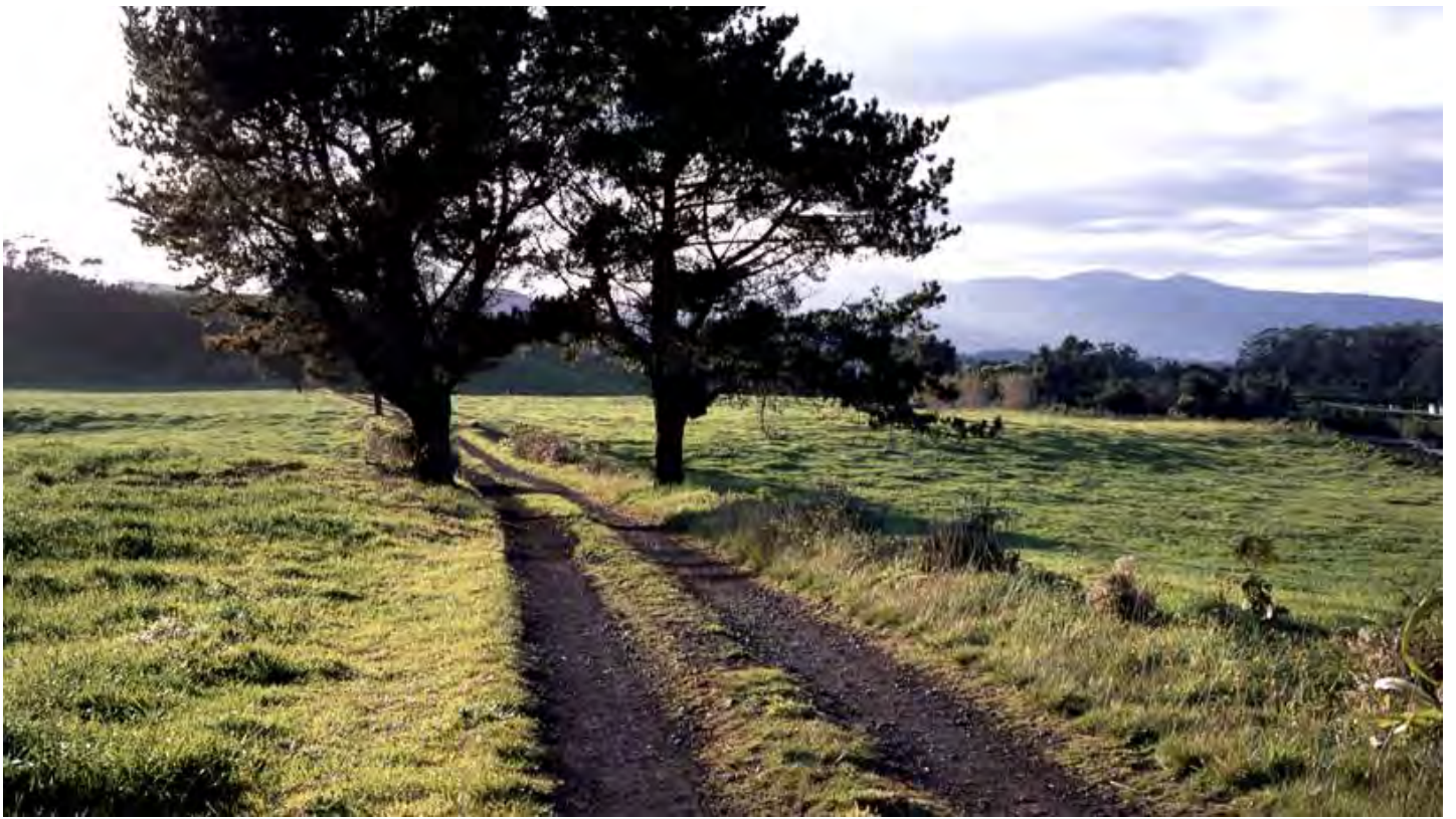
The track to Pico do Refugio in the Azores.

Inside the 16th- and 17th-century buildings, the five lofts and three apartments are sharply contemporary, decorated with mid-century furniture and modern art. From November to April, the property runs an artist residency programme that has seen the likes of Sonic Youth's Thurston Moore along with filmmakers and photographers stay for a month at a time, creating works inspired by the elemental landscape.