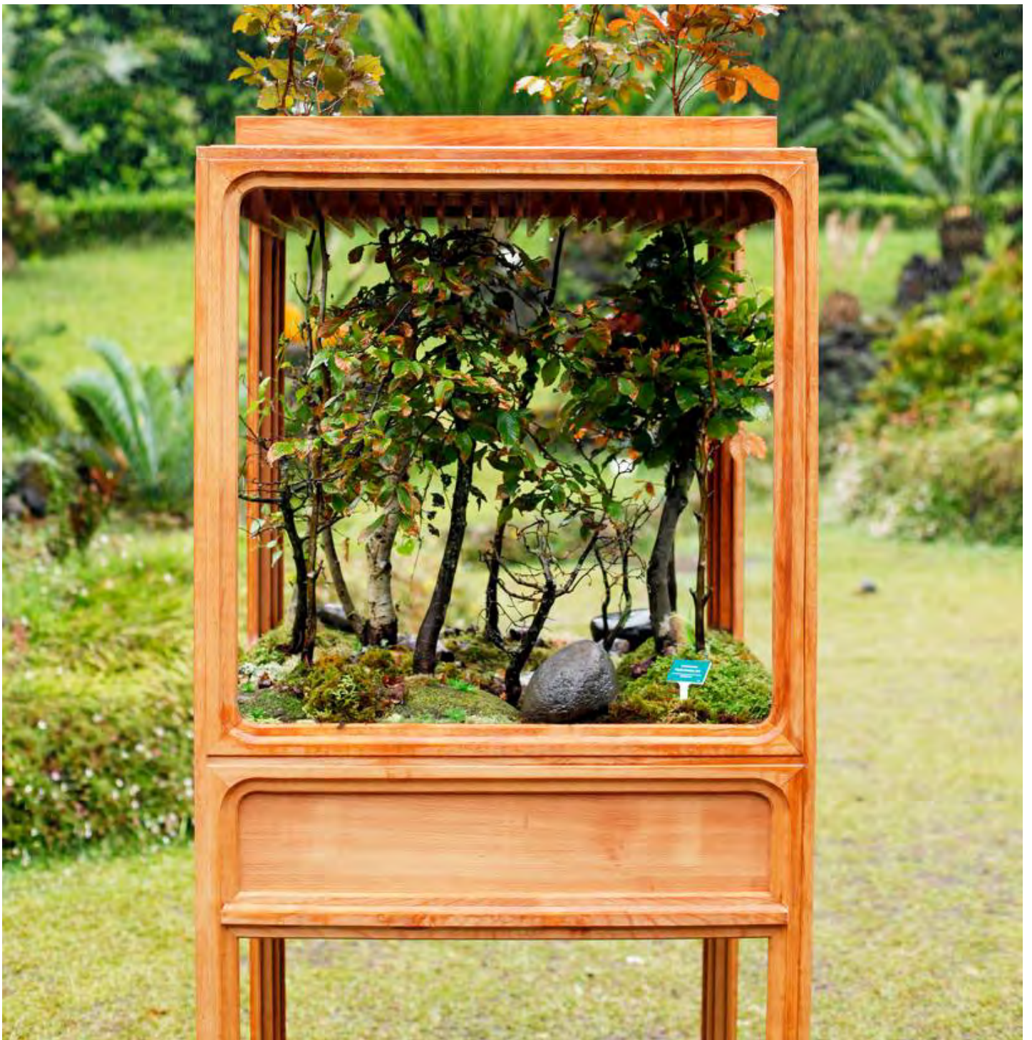
'Nordic Miniature' by Benandsebastian at Walk&Talk 2017 on the Azores