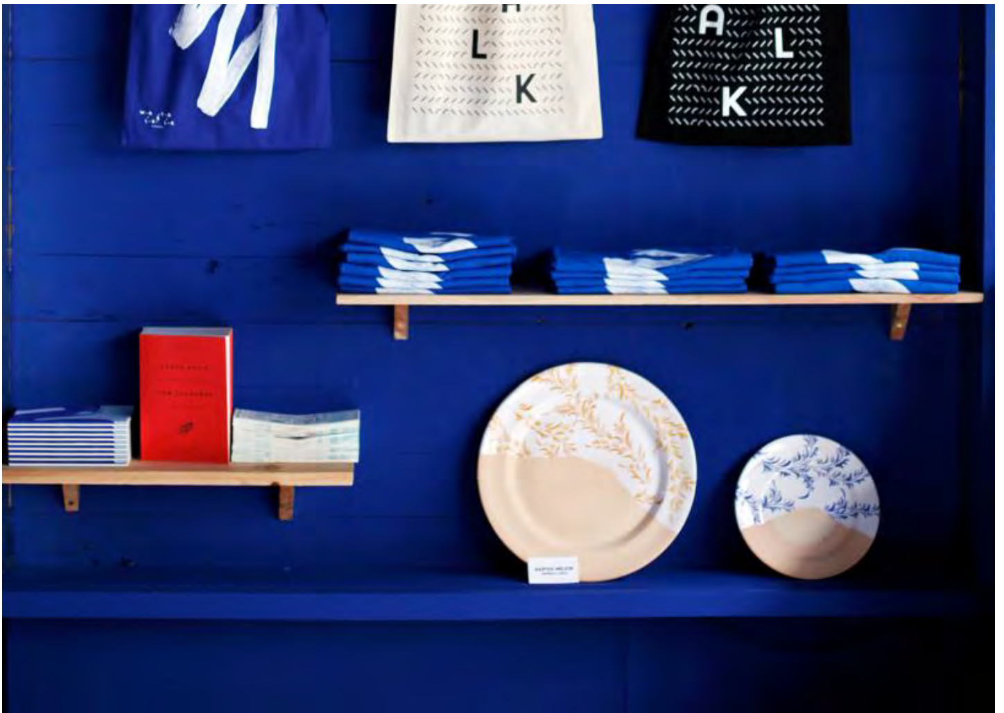
A pop-up shop at Walk&Talk Festival in the Azores