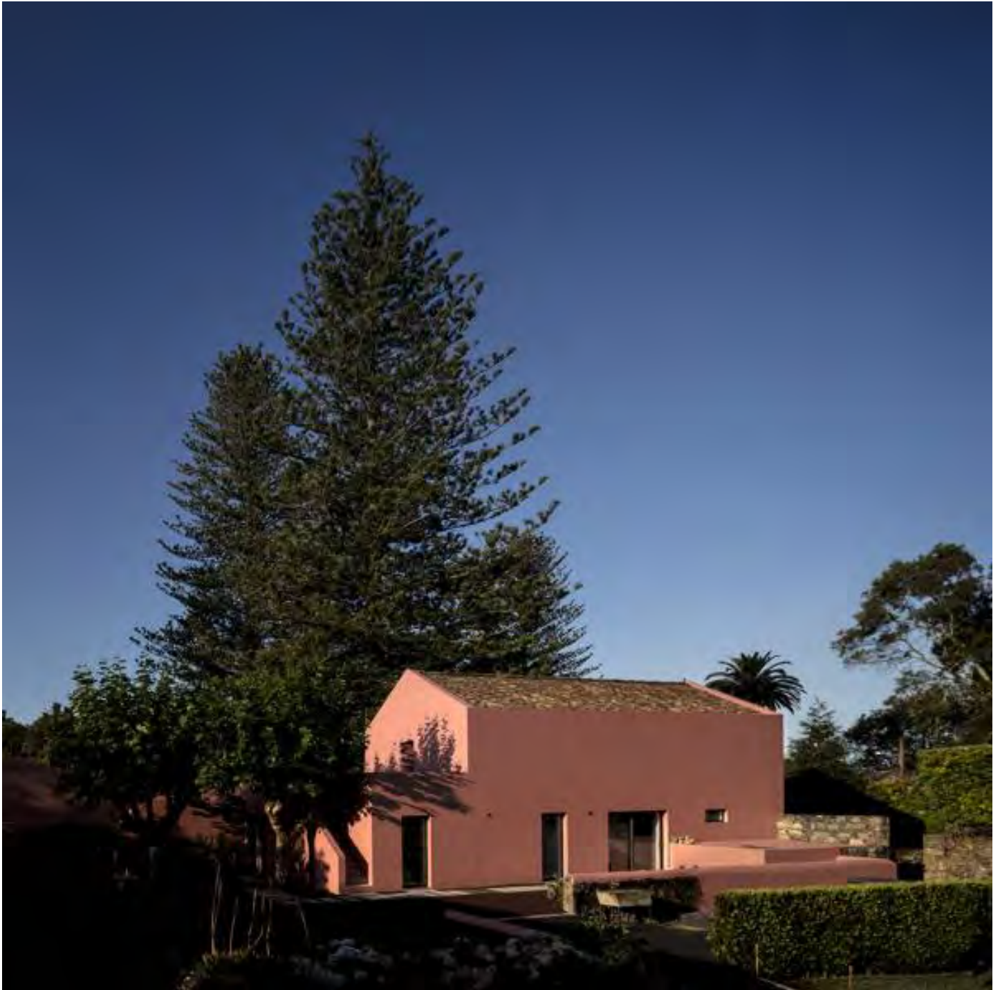
The Pink House in the Azores