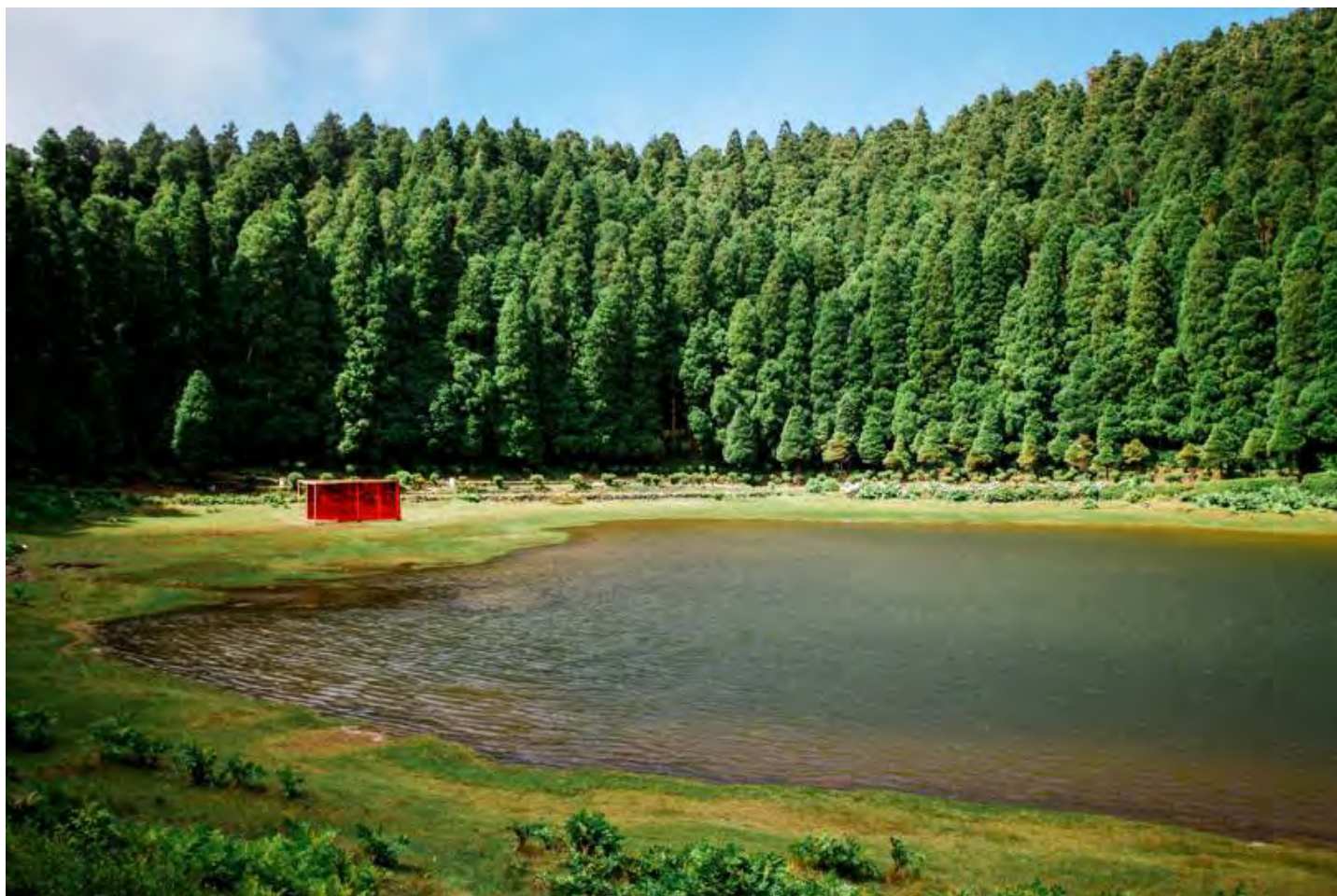
A sculptural installation by Ayelen Peressini at Sete Cidades during Walk&Talk 2017

Portugal's humming creative scenes in Lisbon and Porto have had our heads turning for a while. Now, however, our attention is being drawn some 1,200km off shore, deep into the Atlantic, to the remote Portuguese archipelago of the Azores . The nine volcanic islands – often compared to a cross between Hawaii , Ireland and New Zealand – are best known for their wild allure: lush forests, surreally coloured crater lakes, black volcanic-sand beaches, hot springs and thundering waterfalls; the dramatic backdrop for hiking, surfing, diving and whale spotting.